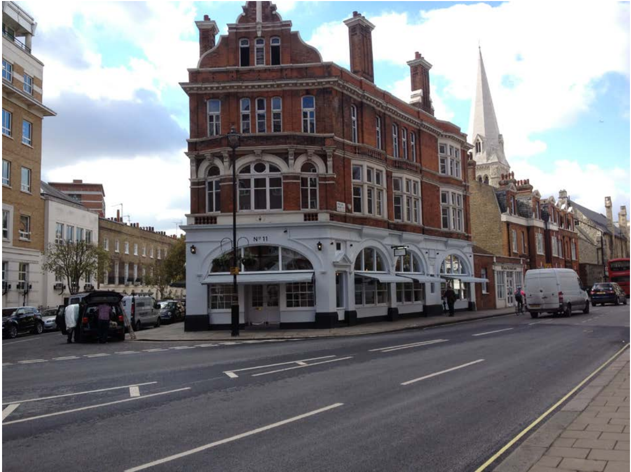
11 Pimlico Road