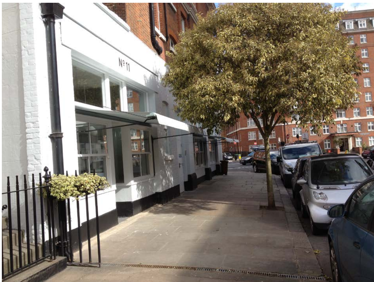
Ranelagh Grove frontage